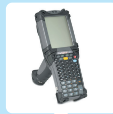
Data terminals & PDA